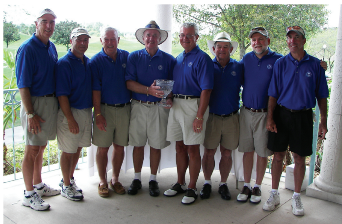
Bluewater Bay, 2007 Interclub Champions

Visit the interclub website to learn more about the Matches and how your club can get involved.